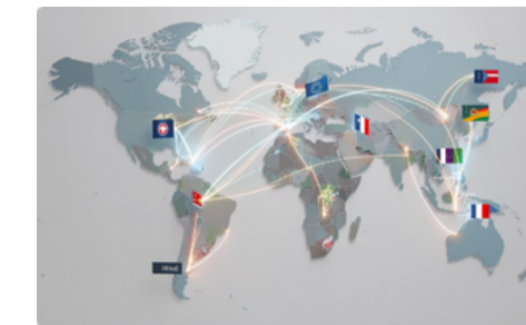
Global Market Access