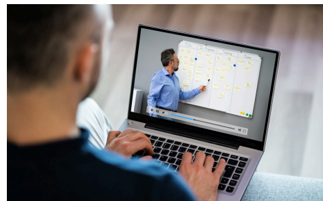
50 hrs virtual mentorship support

Beyond funding, IBSEA BHARAT wraps every startup in a comprehensive support layer — from day-one infrastructure to global market access.