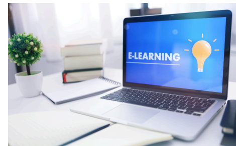
50 hrs Learning hub Access