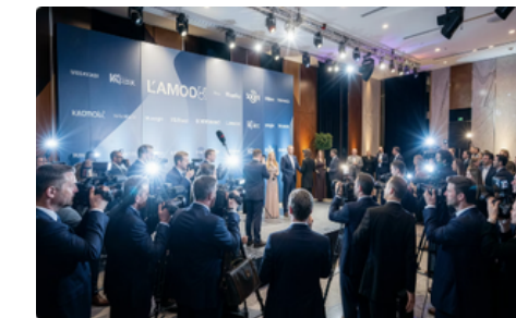
IBSEA confrence and Program access