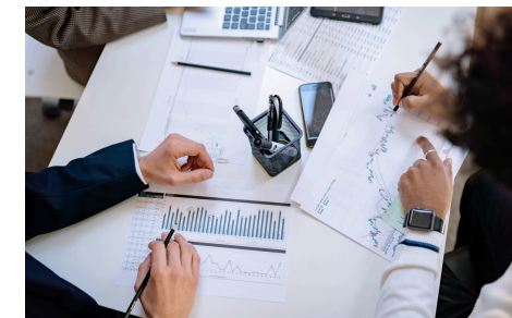
One on one consultation