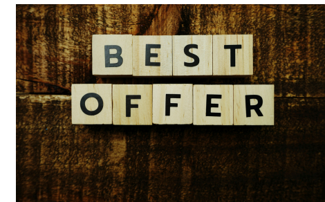
10% off on Vyapar Badaho services